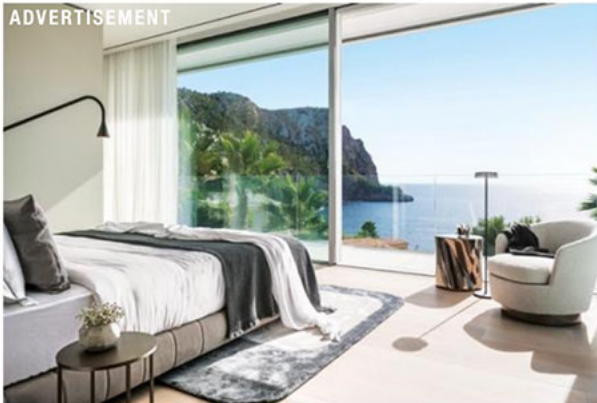
Due to the hillside location, Villa Seahouse extends over four floors. On the first floor, underneath the pool, is the guest wing of the property. The open plan living space on the second floor opens up to a fabulous terrace and pool. The top floor draws residents and guests with its ocean views.