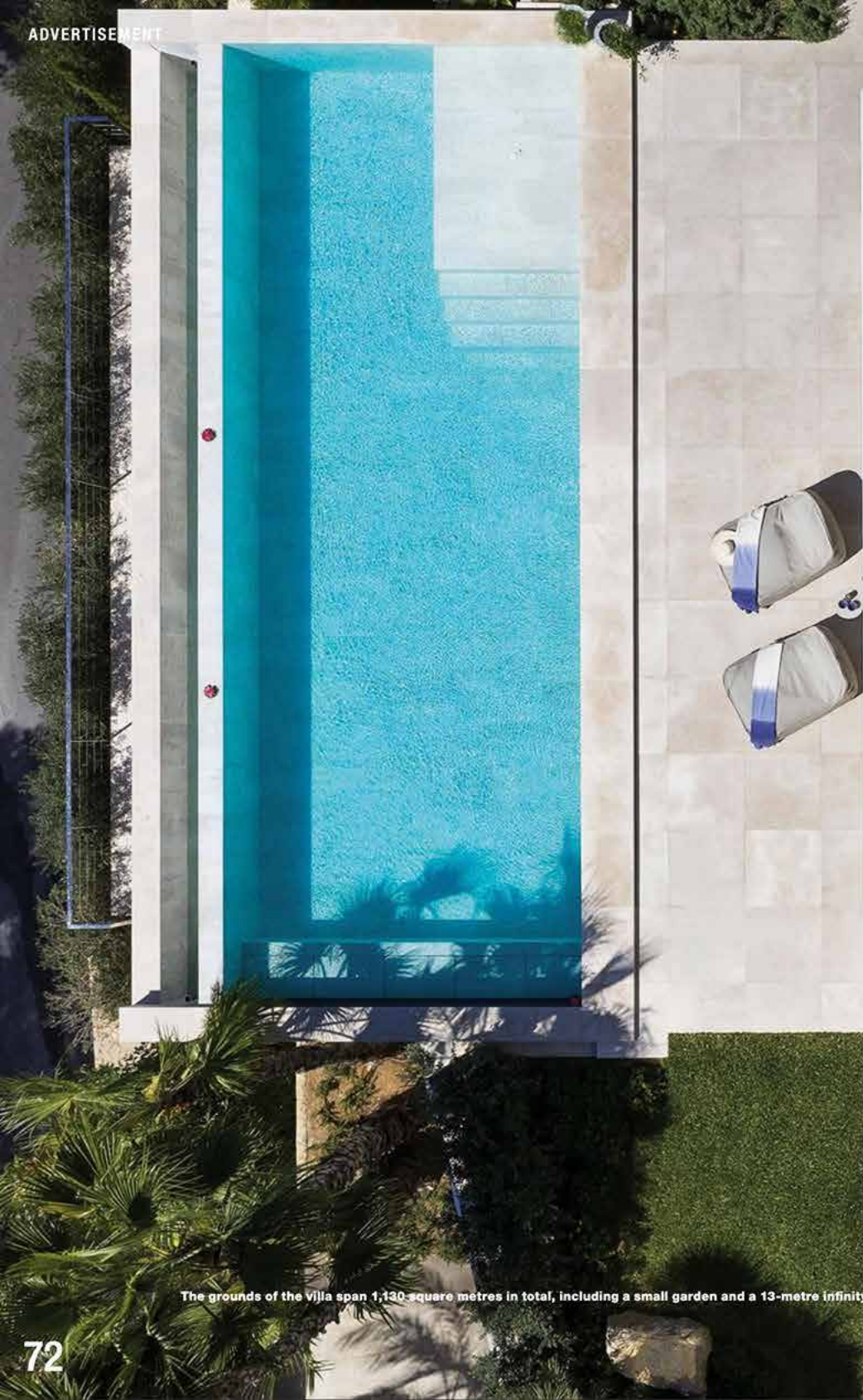
The grounds of the Villa span 1,130 square metres in total, including a small garden and a 13-metre infinity pool.